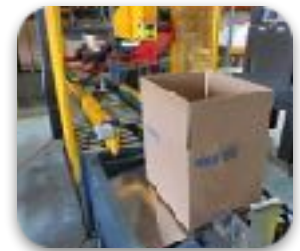
Commonly placed in front of uniform automatic carton sealer with top flap folding