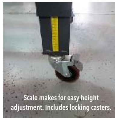
Scale makes for easy height adjustment. Includes locking casters.