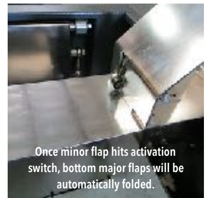
Once minor flap hits activation switch, bottom major flaps will be automatically folded.