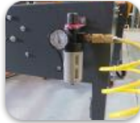
Air regulator with pressure gauge