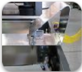
Kick plate folds minor flaps and activates bottom flap folders to secure box in place for loading