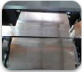
Bottom flap folders in closed position will hold box in place for loading