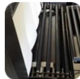
High Density Rollers - Close Roller Spacing 1/2" Gap

The PP1808-28 Shrink Tunnel is a great general purpose shrink tunnel that can be used for a wide variety of applications. Can be used with shrink bands, neck bands, full body sleeves, used with shrink film, used as a drying or curing tunnel etc.