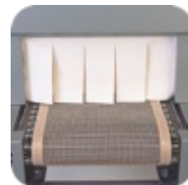
Teflon Mesh Belting