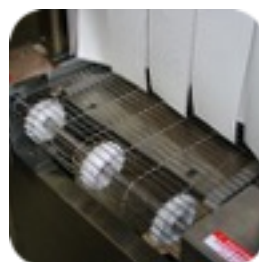
Stainless Steel Metal Mesh Belting