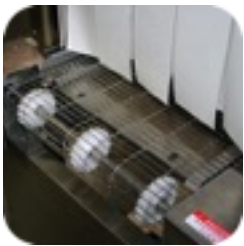
Stainless Steel Metal Mesh Belting