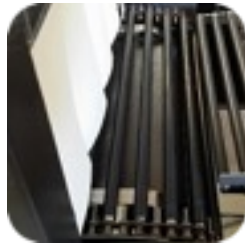
High Density Rollers - Close Roller Spacing 1/2" Gap