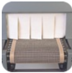
Teflon Mesh Belting